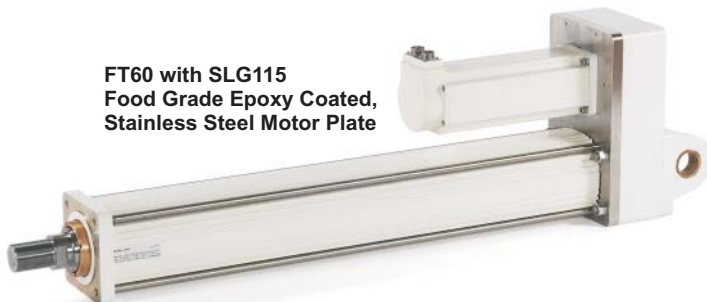
FT60 with SLG115 Food Grade Epoxy Coated, Stainless Steel Motor Plate