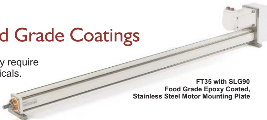
FT35 with SLG90 Food Grade Epoxy Coated, Stainless Steel Motor Mounting Plate

Exlar will work with you to tailor a solution specifically engineered for your application.