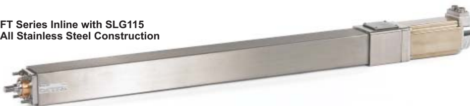
FT Series Inline with SLG115 All Stainless Steel Construction