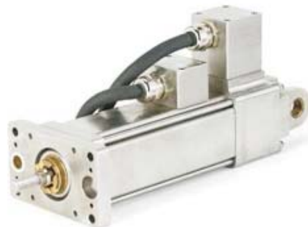
All Stainless Steel GSX20 Linear Actuator